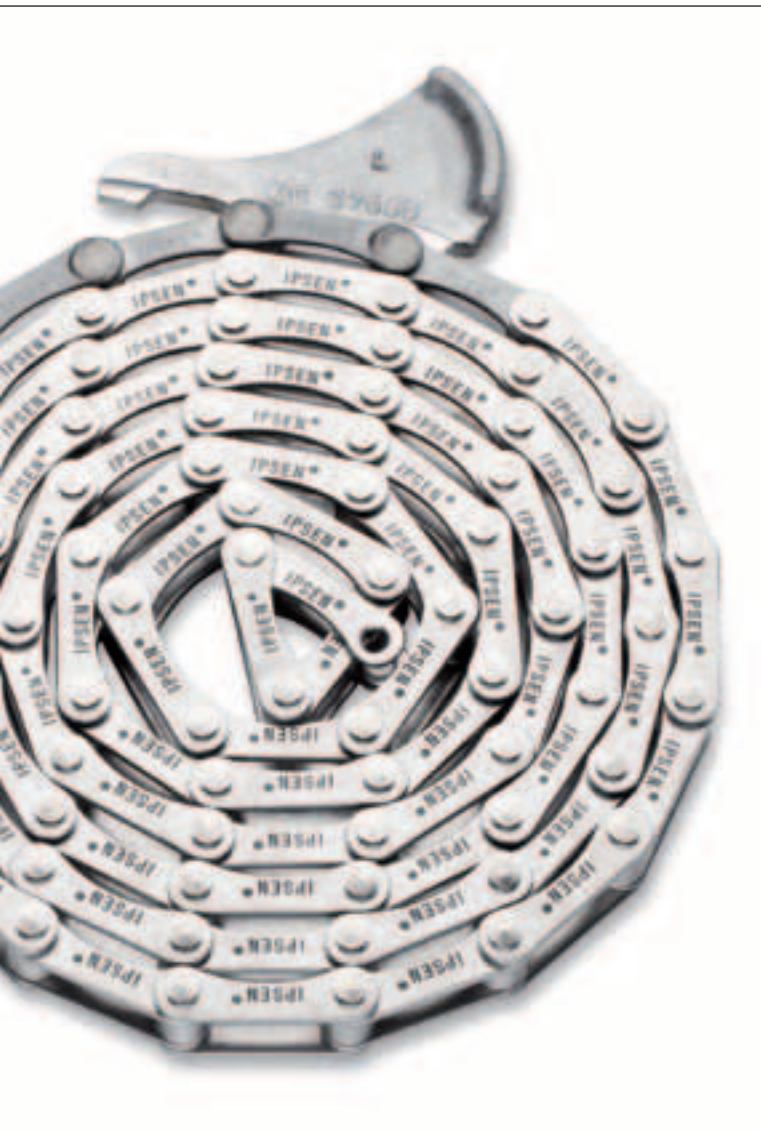
The reinforced universal chain for charge weights up to 2 t

This universal chain is also welded and comprises a cold and hot part. Thanks to its robust design it can be used for charge weights of up to two tons.